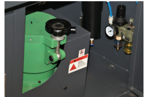
Sealed glue pot to reduce waste