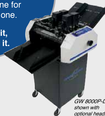
GW 8000P-DS shown with optional heads.